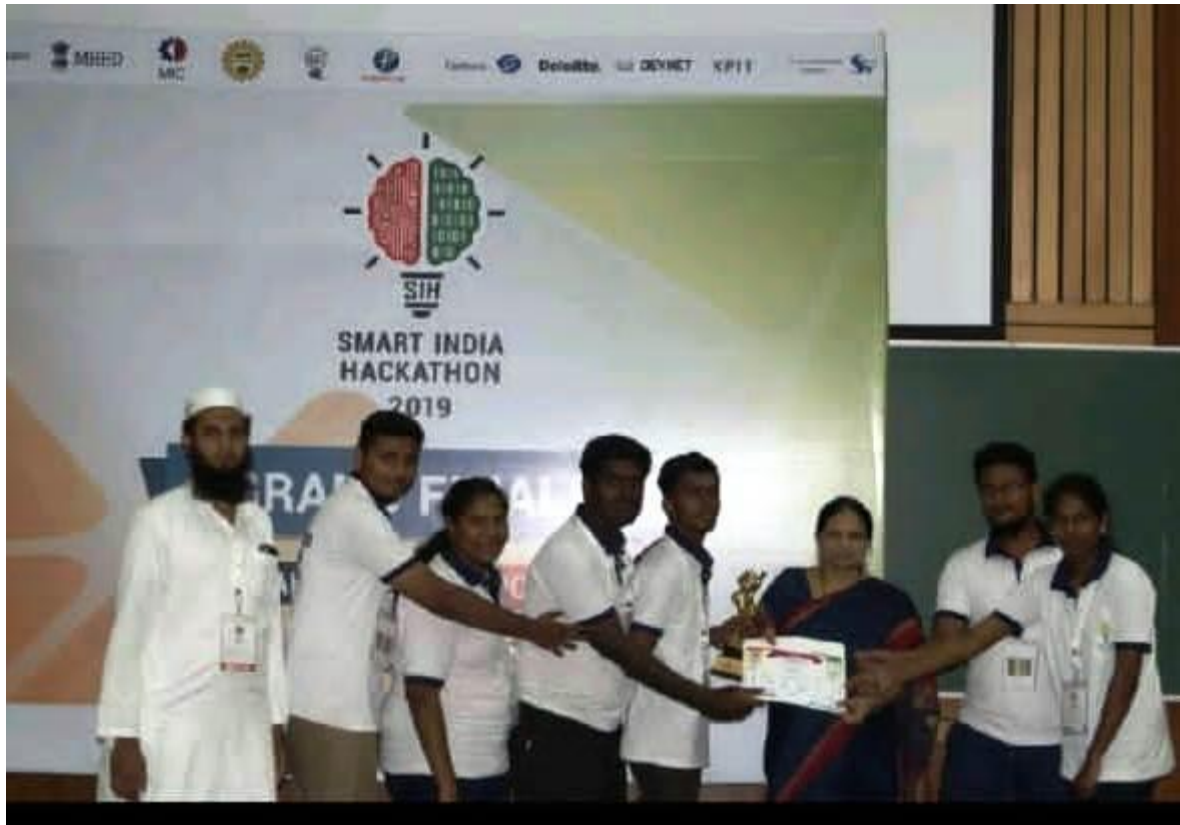
Smart India Hackathon 2019 Award – Winner