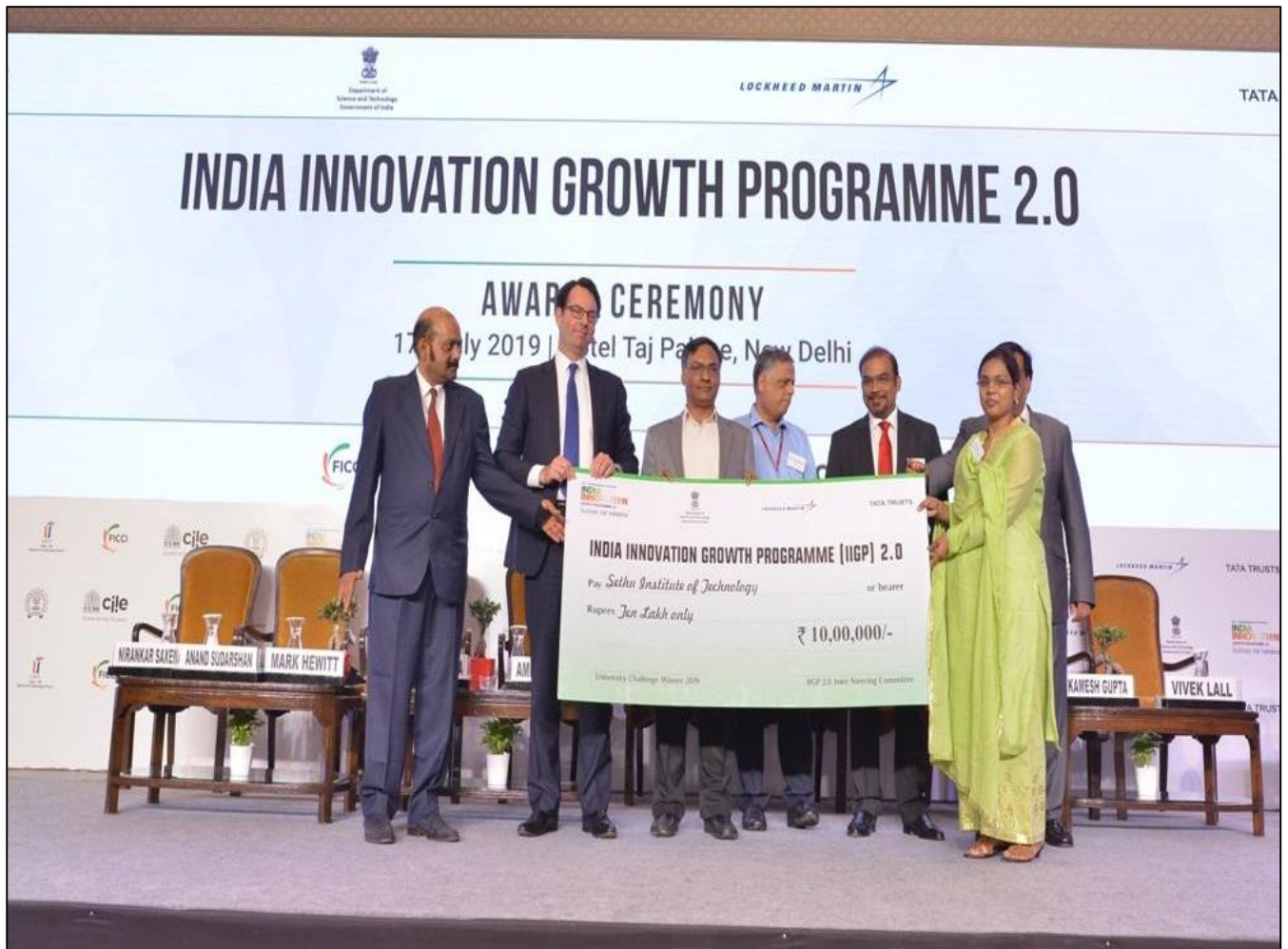
DST-LOCKHEED & IIGP 2.0 AWARD 2019

Awarded Rs.10 lakhs under the DST – Lockheed IIGP 2.0-University challenge