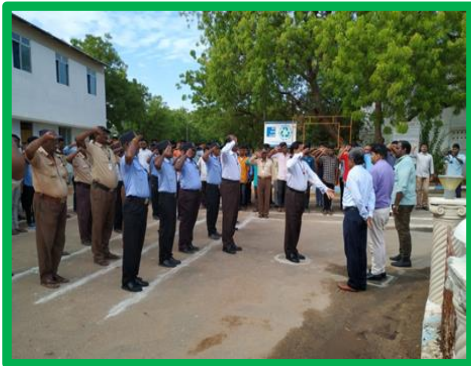
Independence Day Parade