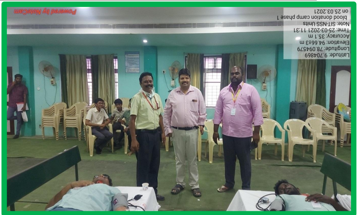
Students donating blood during Blood Donation Camp arranged by Meenakshi Mission Hospital at Sethu Institute of Technology