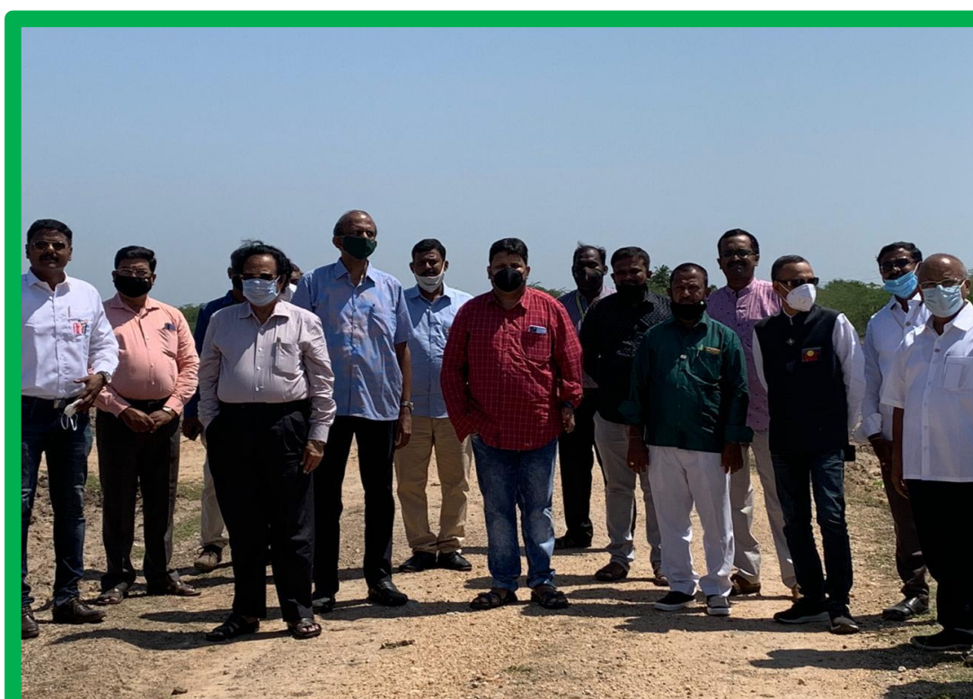
Our chairman Allocating 1 acre land from our farm to Plant 6000 saplings at Sethu Institute of Technology campus.