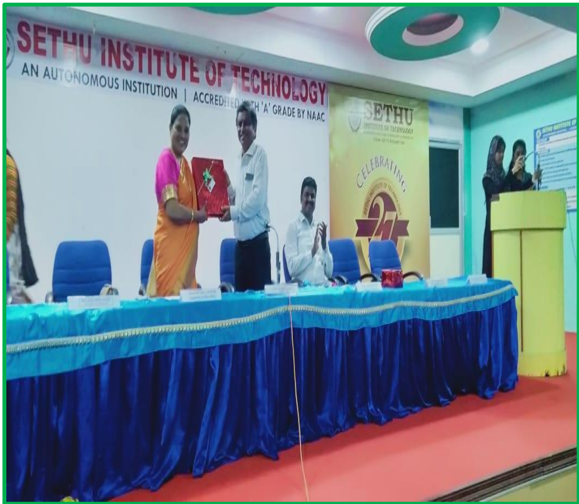
Eminent Guest in the inauguration of the Event Organized by WEC OF Sethu Institute of Technology