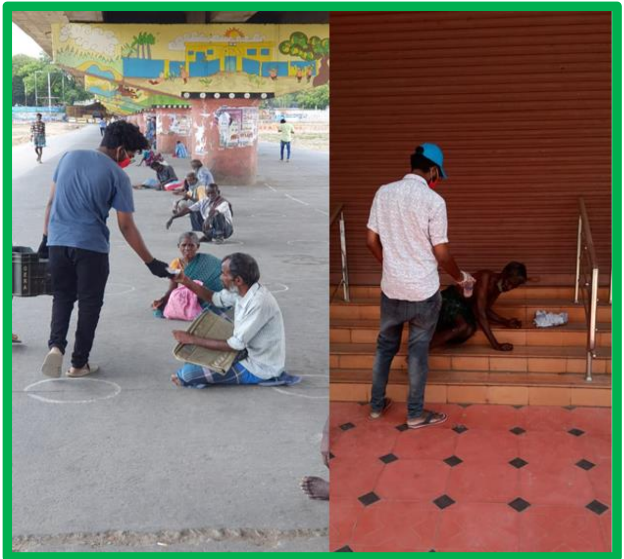
NSS Volunteers Provide food for 300 needy people during pandemic