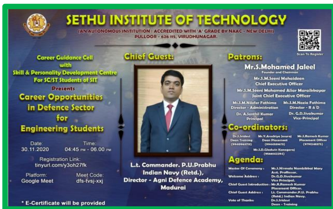
Invitation of the Event