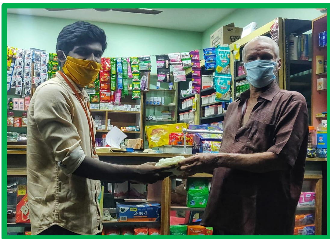
NSS Volunteers Provide medicine for above 53 age adults affected by COVID on 02.07.2020