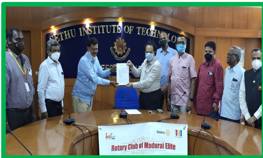
MOU with Rotary club of Madurai Elite.