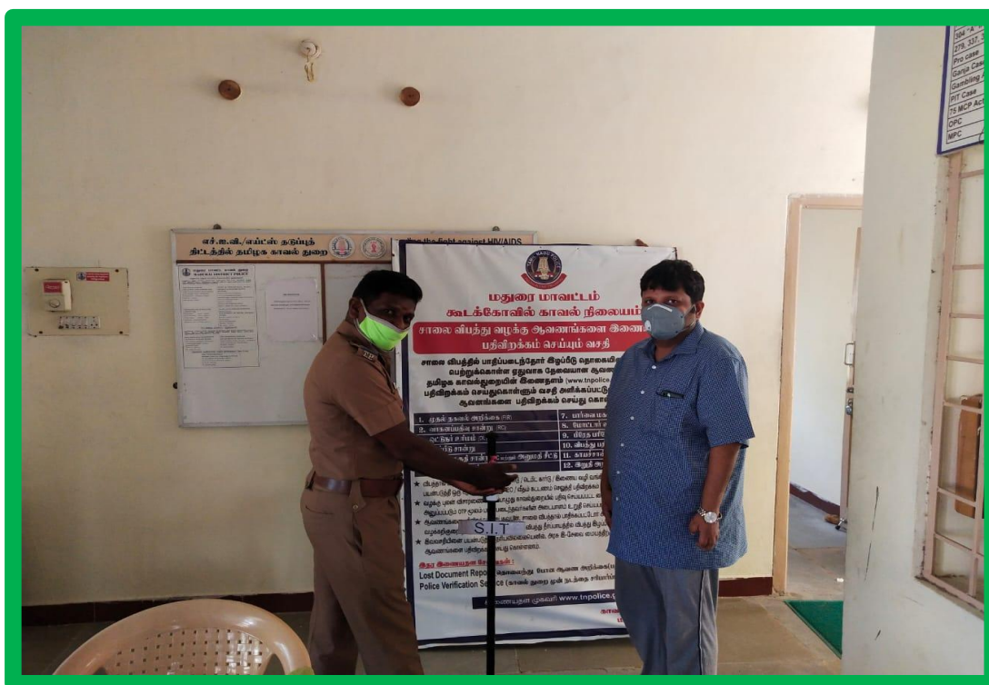
Donated two hand sanitizer stand to Aviyur police station and Thasildar office by JCEO of Sethu Institute of Technology on 01.07.2020