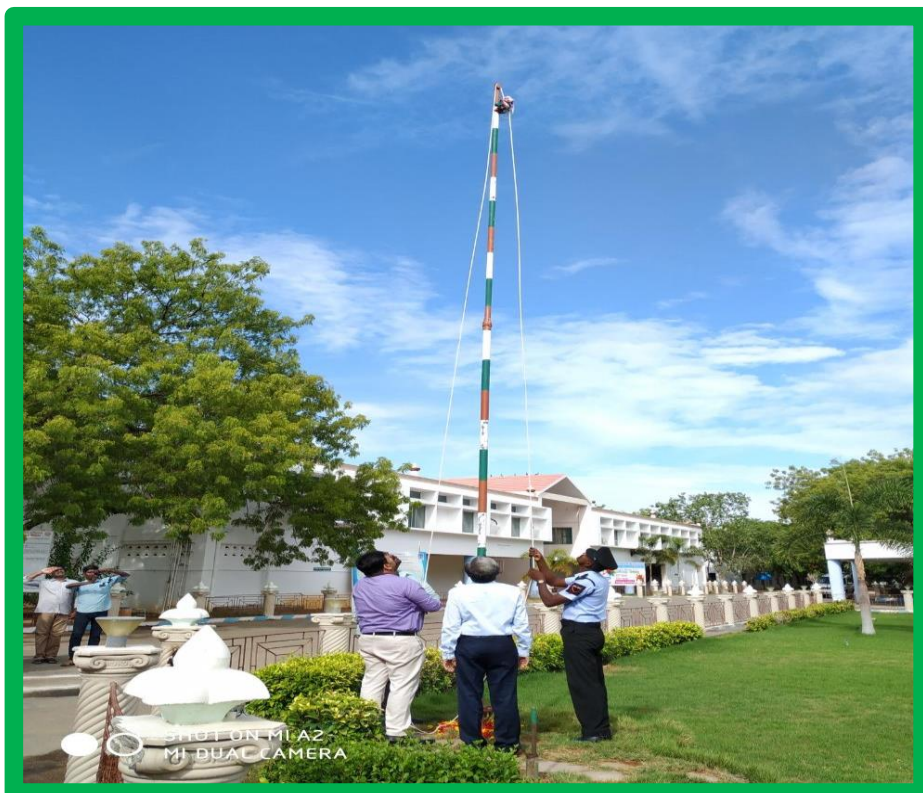
Independence Day Flag Hoisting at Sethu Institute of Technology