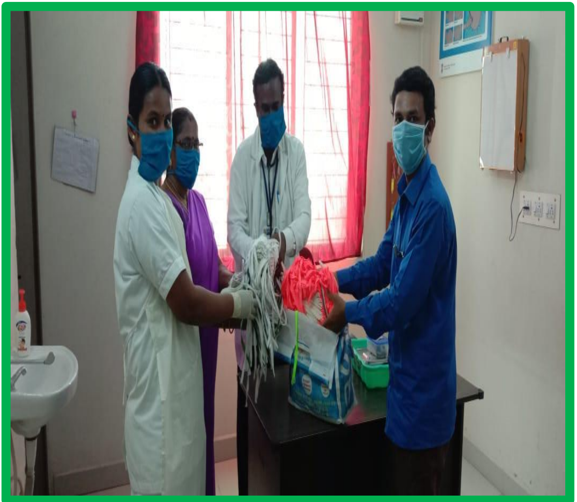
Our Faculty Provide 500 mask to the Primary Health Centre