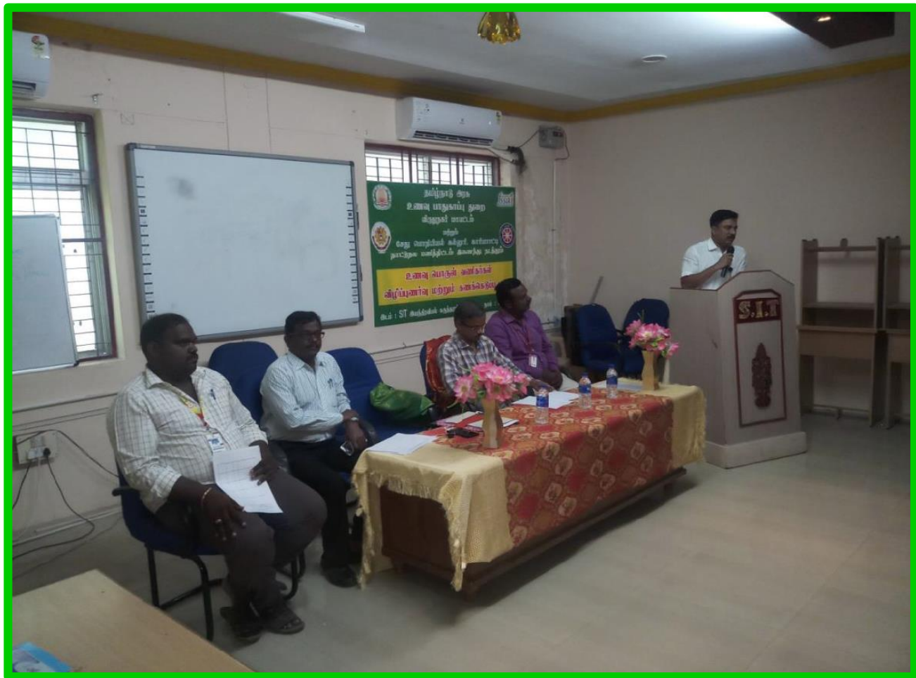
Awareness of Food Merchants and survey by the Department of Food Safety and Drugs Administration at Sethu Institute of Technology