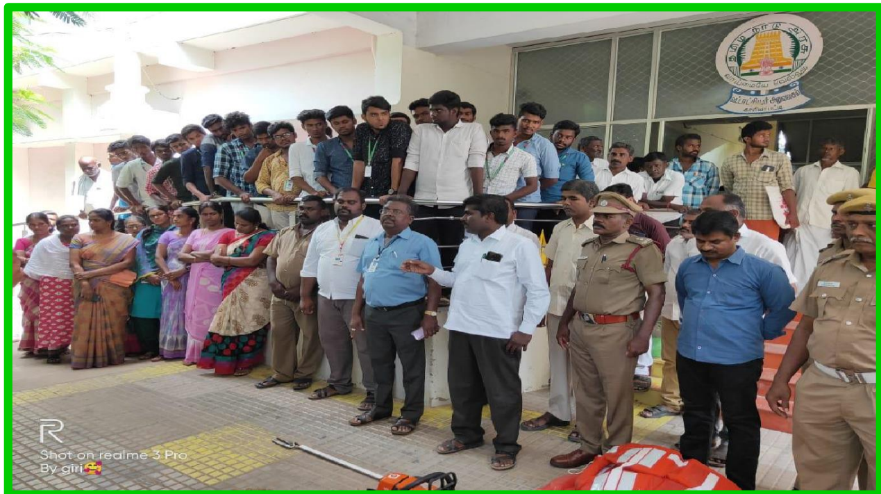
Demonstration on Disaster Management and Fire safety by National Disaster Management Authority