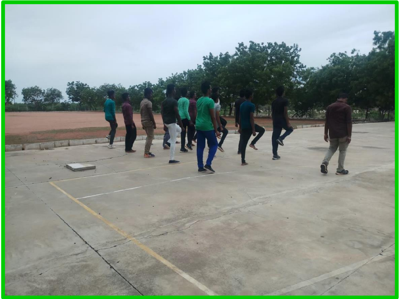
Pre Republic Day Parade by the students at Institute Level