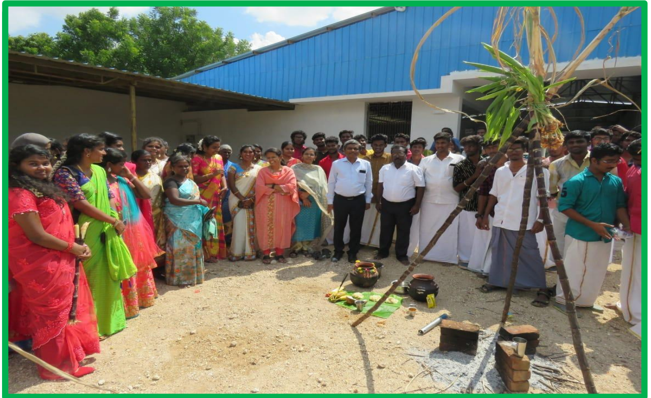
Pongal Celebrations in the College Campus