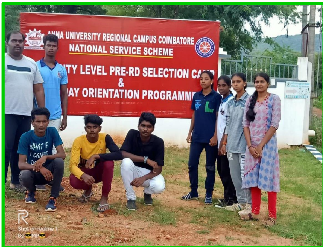
Participation of NSS students in the Pre Republic Day Parade at University Level