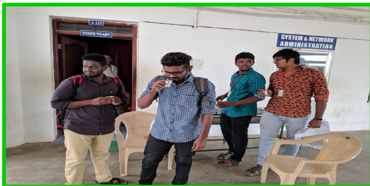
Arrangement of Nilavembu Pandhal as a Dengue Preventive Measure