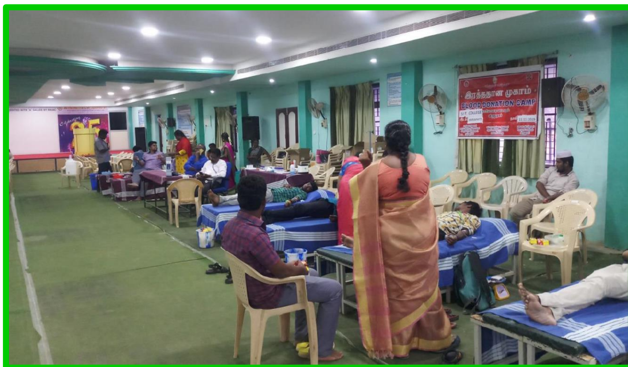
Students donating blood during the blood donation camp at Sethu Institute of Technology