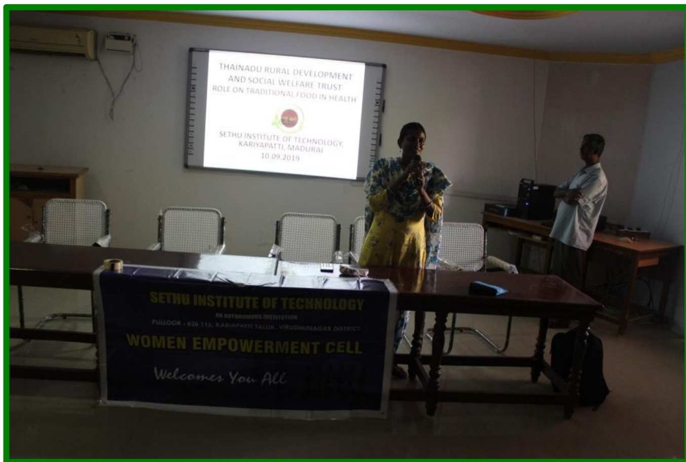
Guest Speaker delivering the speech on “The importance of traditional food for health”