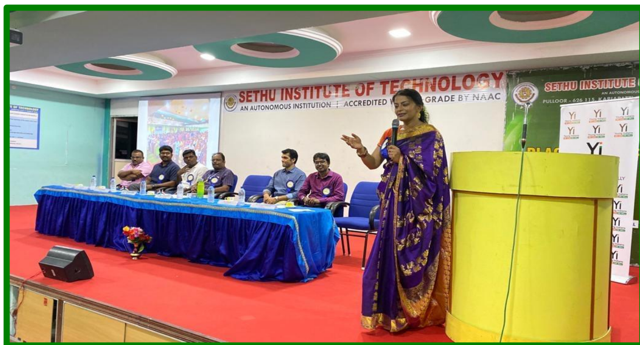
Guest speaker delivering the lecture on “Challenges and Opportunities for today’s youth”