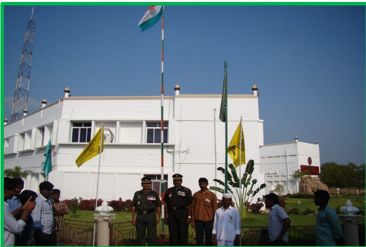
Flag Hoisting and Parade