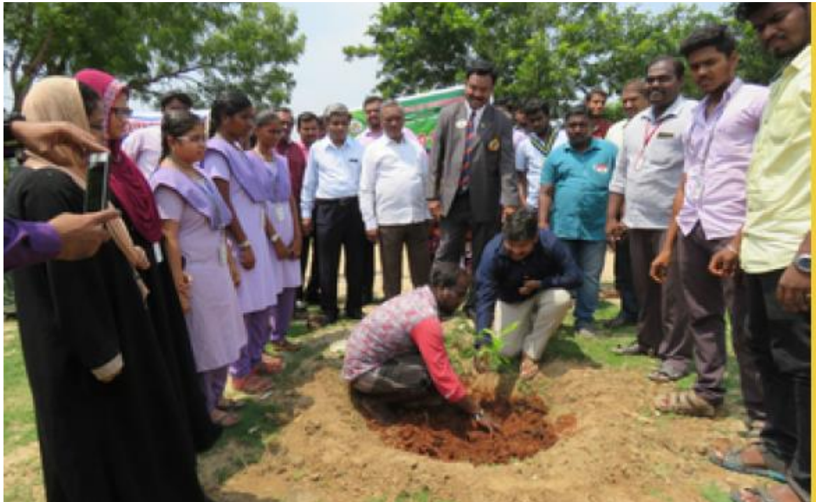
Tree Plantation at our college campus