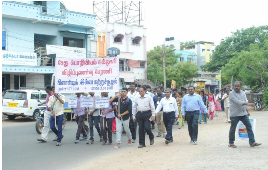
Rally on 'Plastic Free Environment' at Madurai 11.07.2018