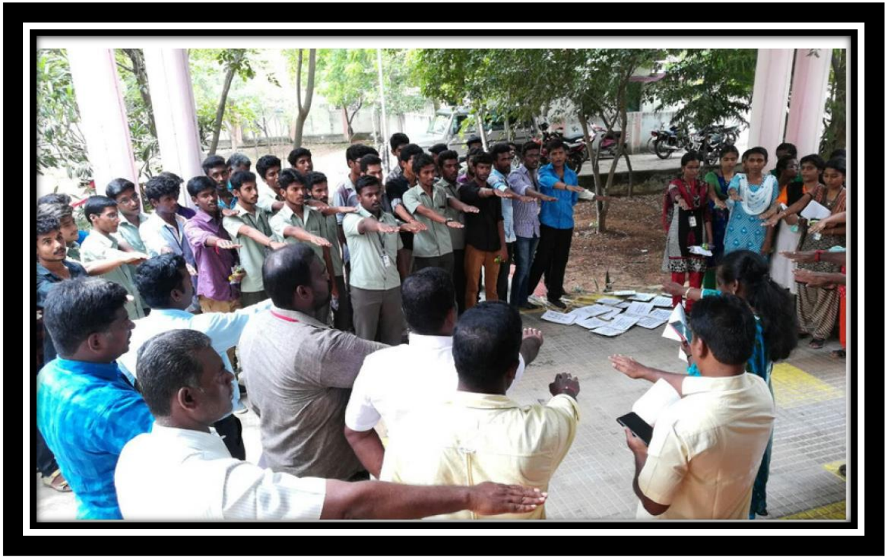
Rally on Disaster Reduction was held at Thasildhar office at Kariapatti