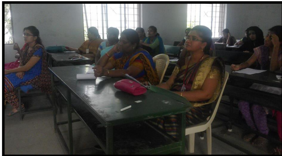
National Science Day celebration Feb 28th 2018