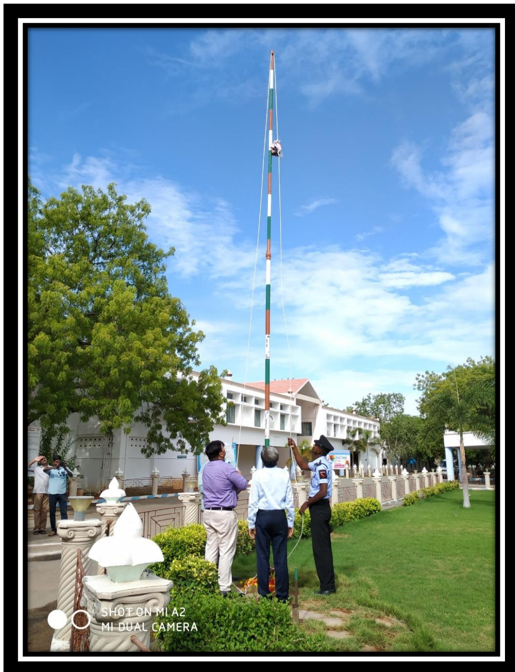
Independence Day Flag Hoisting - 15.08.2019