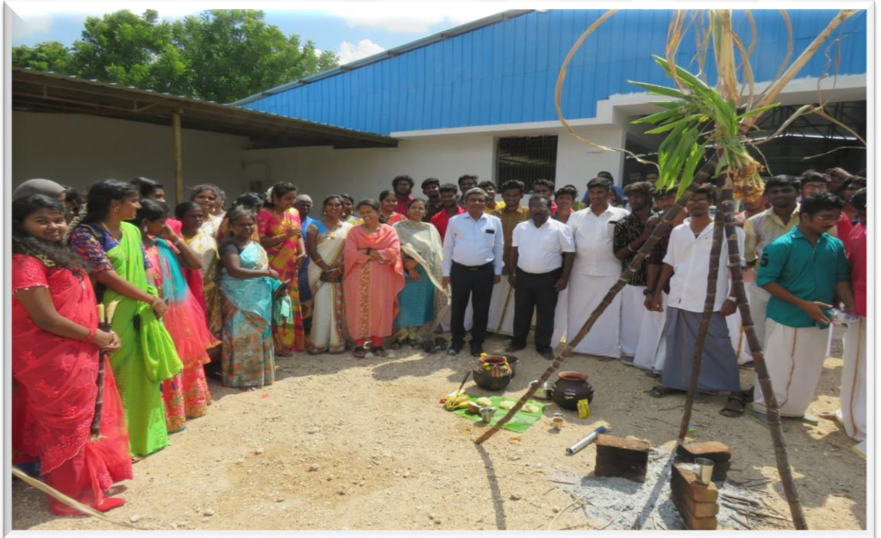
Pongal Day Celebration