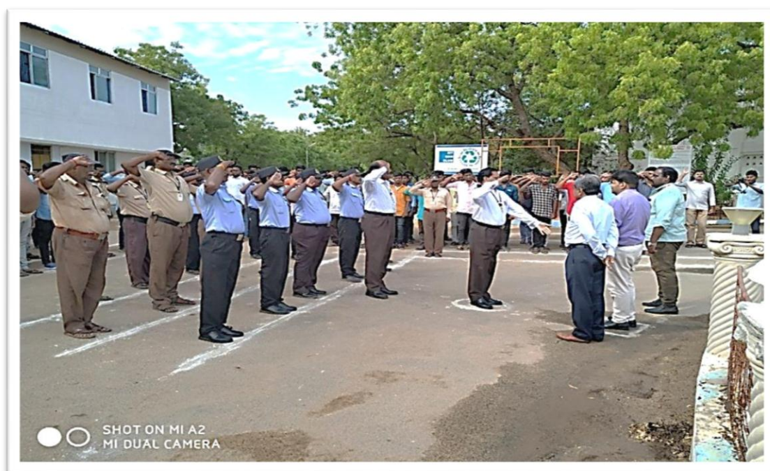
Independence Day Flag Host on 15.08.2020