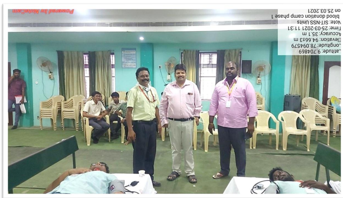
Blood Donation Camp Organized by NSS along with the Collaboration of Meenakshi Mission Hospital Madurai on 25.03.2021