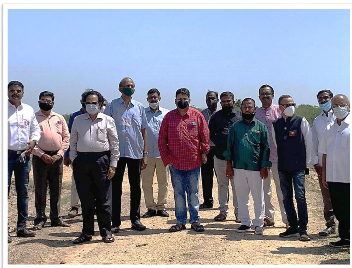
Initiating MIYAWAKI Forest on 28.08.2020