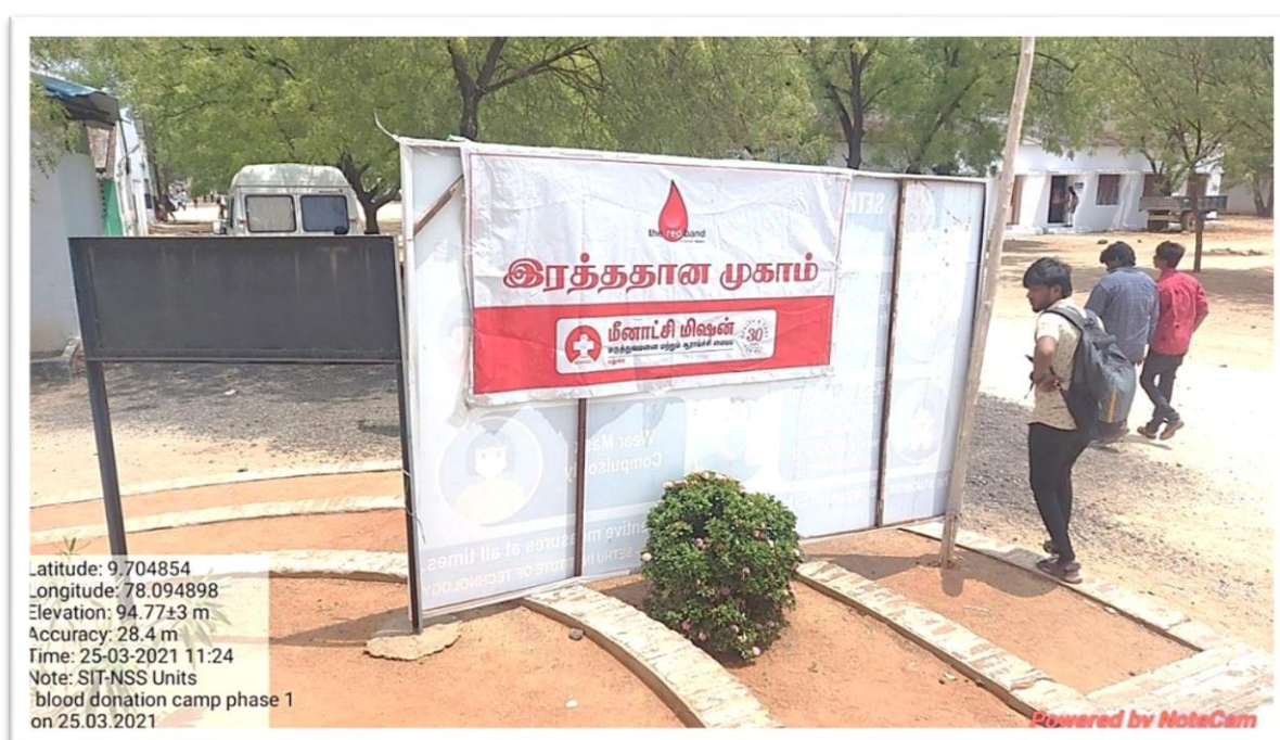
Blood Donation Camp Organized by NSS along with the Collaboration of Meenakshi Mission Hospital Madurai on 25.03.2021