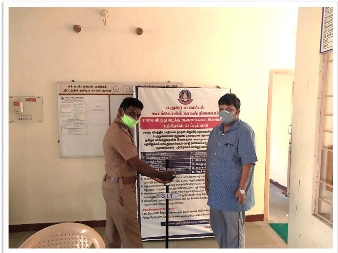
Hand sanitizer stand Donation in the year 2021