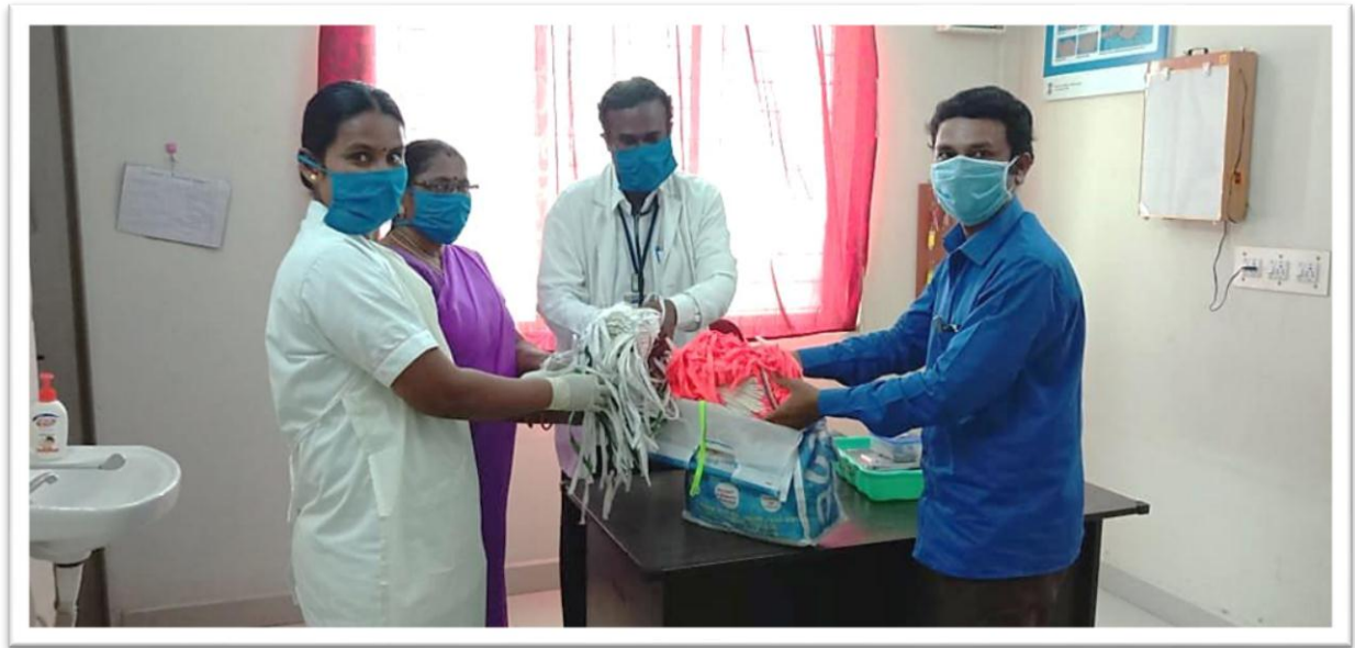
Free Mask Sponsoring to Primary Health center on 02.07.2020

During the Covid period due to the shortage of Mask the doctors were attend the patients with fear. So the faculty members of Sethu institute of technology donated 500 masks to the Primary Health center.