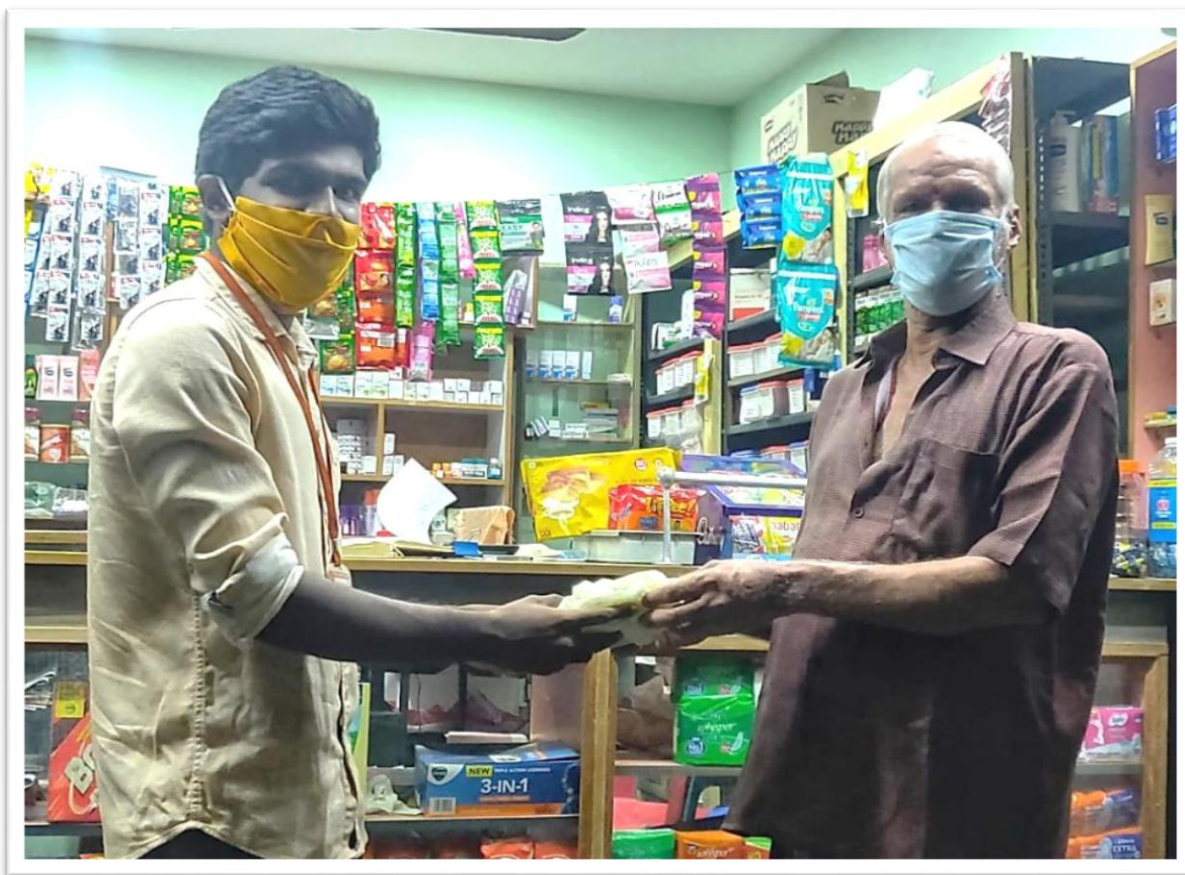
MediBoy - Covid Rescue team on 01.07.2020