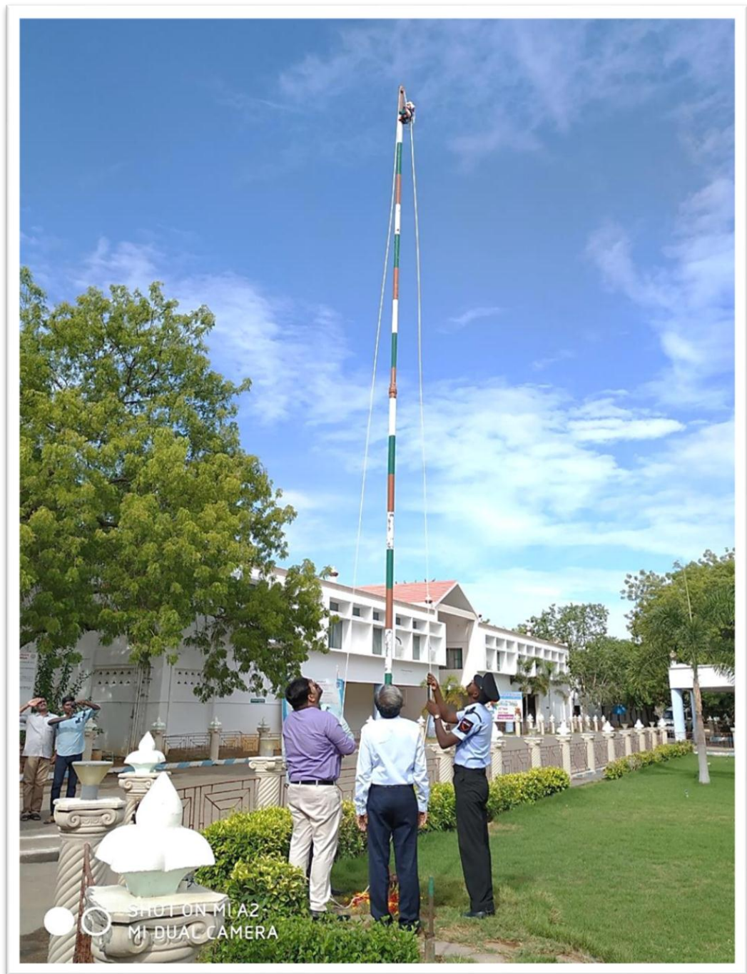
Independence Day Flag Host on 15.08.2020