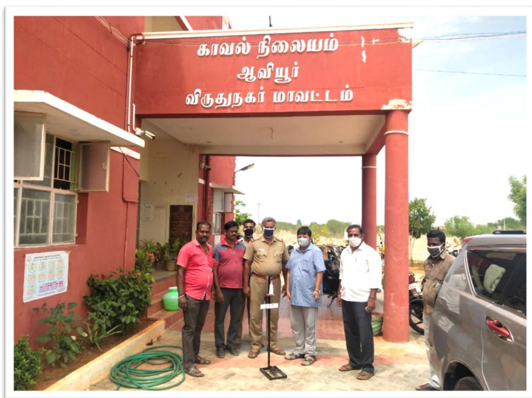
Hand sanitizer stand Donation in the year 2021

The event concluded with a social awareness speech given to the students and the public about the need to take precautions and follow guidelines issued by the government to contain the spread of the virus. The officials and representatives from Sethu Institute of Technology urged people to take the pandemic seriously and to do their part in helping to prevent its spread.