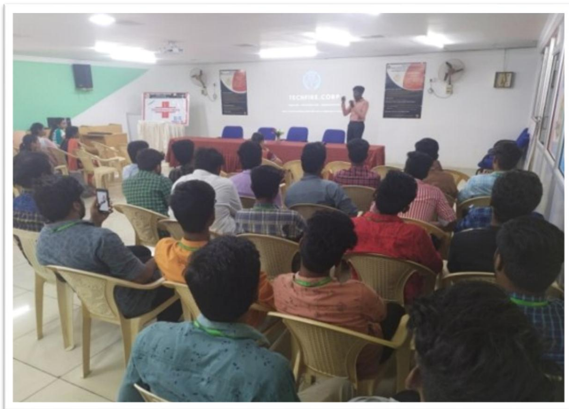
Awareness on ultimate resource of success at IT Seminar Hall, SIT on 05.03.2020

On March 5 th , 2020, Tech Fire Corporation and YRC collaborated to organize an activity called "Awareness on Ultimate Resource of Success" at the IT Seminar Hall of SIT. The aim of this activity was to educate and inspire students about the key factors that lead to success.