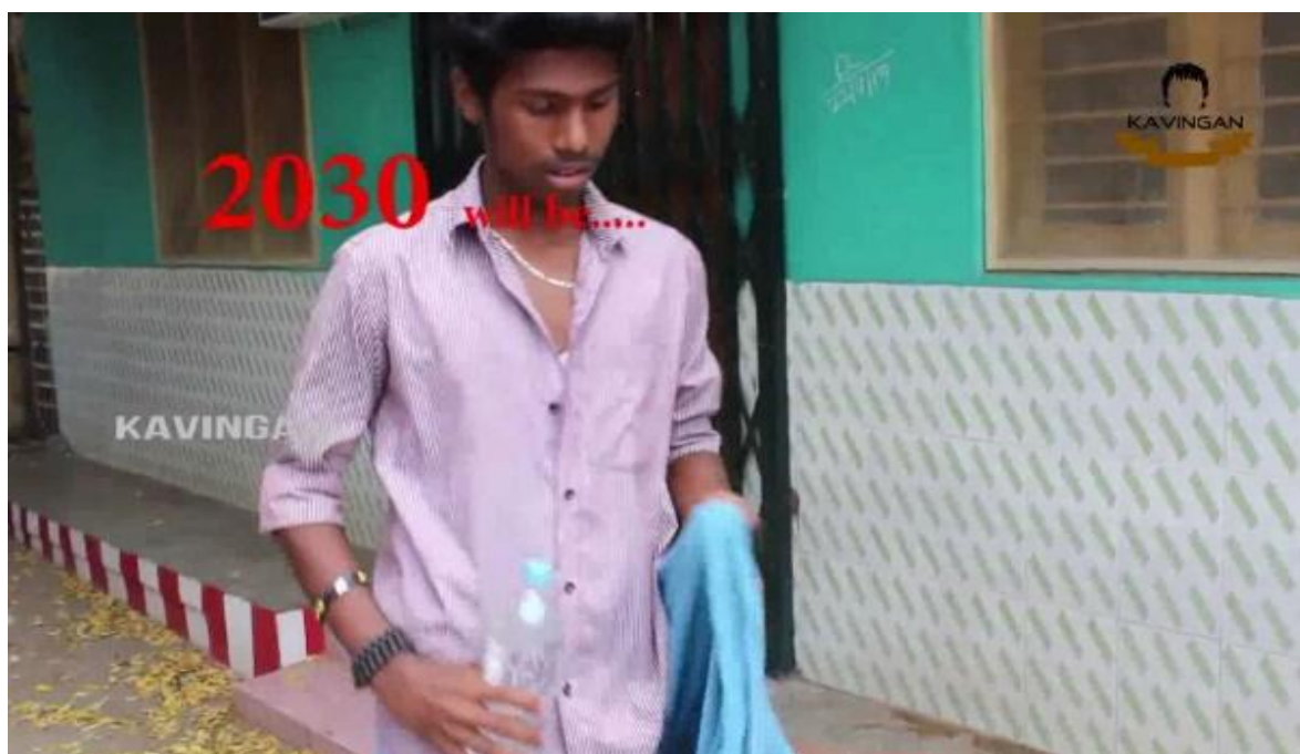
Short Film Event organized by YRC Madurai Division in the year 2017