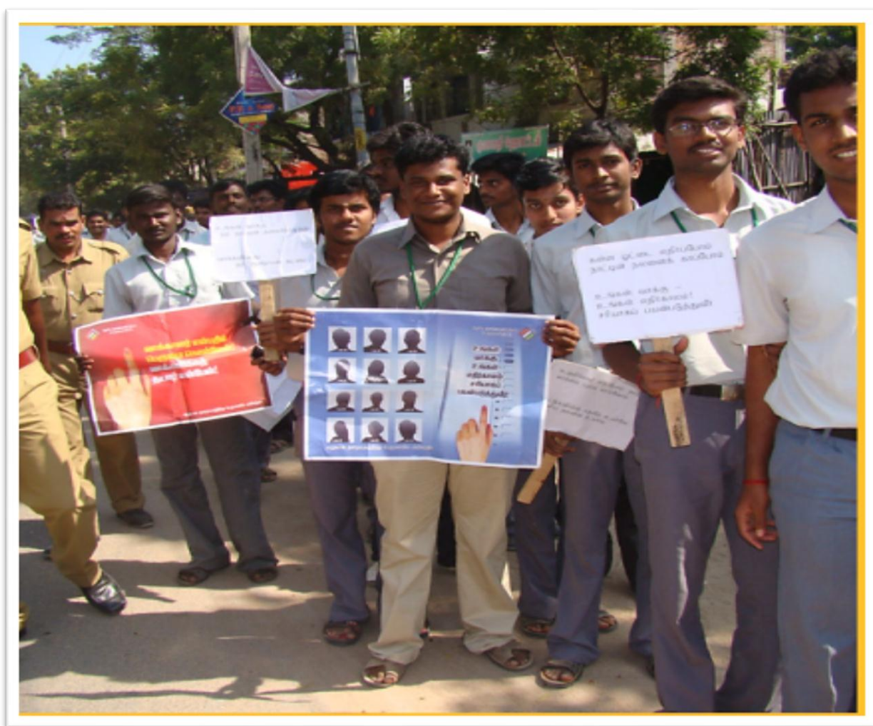
Awareness Rally on voters ID in collaboration with Dept. of Revenue, Thasildar Office – Kariapatti in the Year 2017