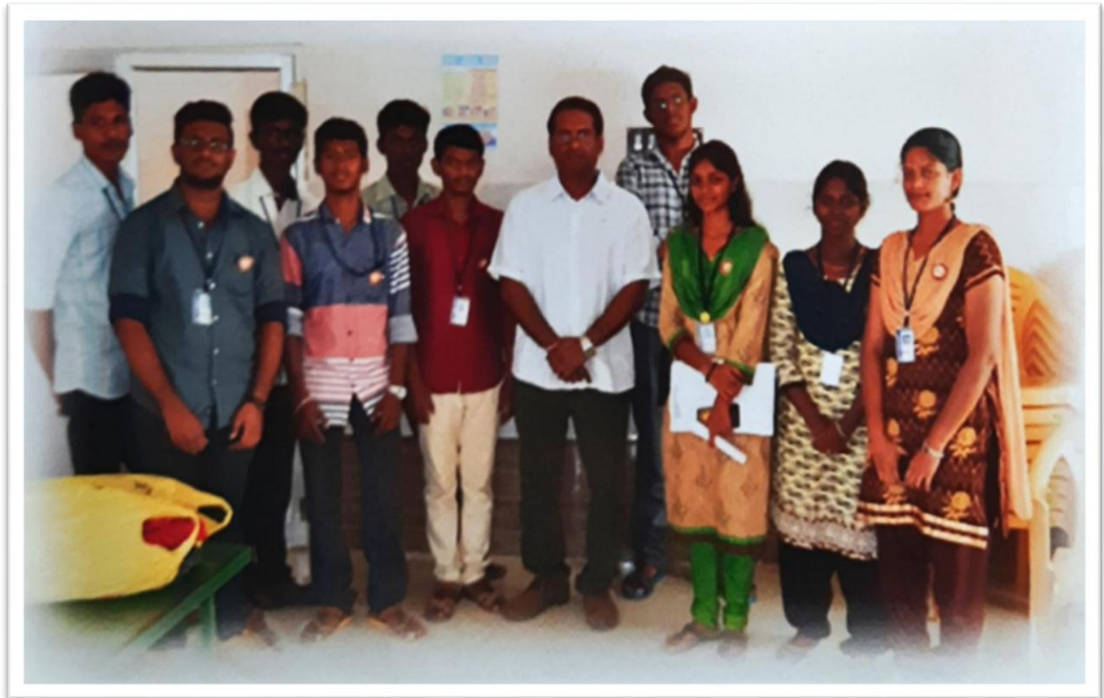
RYLA – 2017 at Sethu Institute of Technology on 17.03.2017

In March 2017, the Rotaract Club organized a RYLA-2017 event for the students. RYLA stands for Rotary Youth Leadership Awards, and it is a leadership training program organized by Rotary International for young adults. The event aimed to develop leadership skills and promote personal and professional growth among the students.