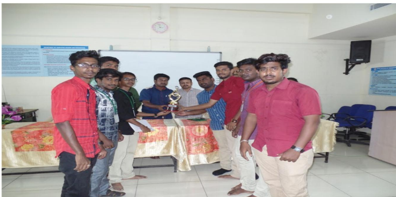
Star Champion Event at Sethu Institute of Technology on 08.10.2017

The Fine Arts Association, Women Empowerment Cell & ECO club of our college in association with Smart Magic (Web based company) organized an Inter-Collegiate Technical and Non-Technical Event (STAR CHAMPIONS) on 08.10.17.