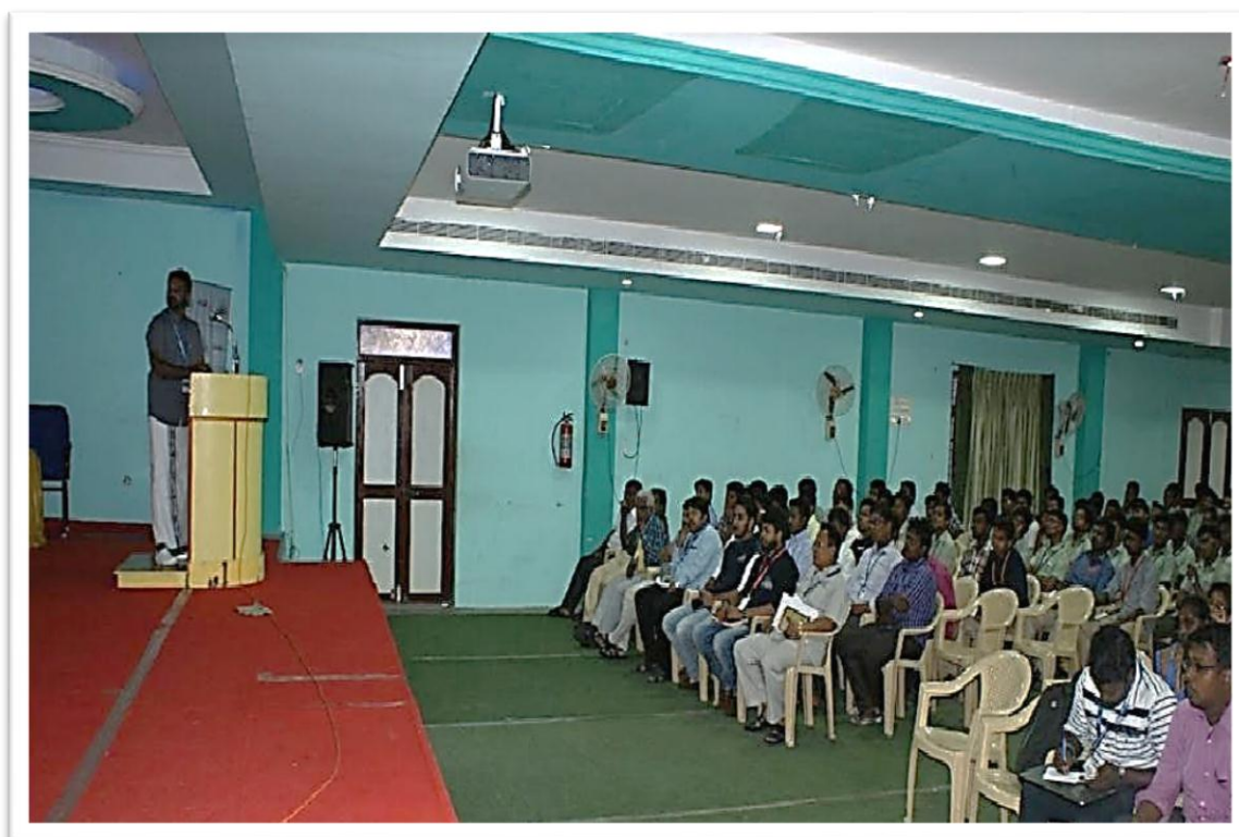
Sustainable Enterprise Award at sethu Institute of Technology on 05.09.2017

Eco Club, Entrepreneurship Development Cell of our college, JAGRITI YATRA and Coca-cola jointly organized orientation program on 'Sustainable Enterprise Award' competition related to Water, Agriculture and Recycling areas for our college students on 05-09-2017 at 10 AM in our college Auditorium. About 250 students attended the orientation program and get benefit of it.