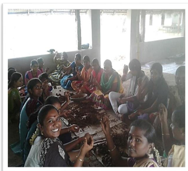
Seed Ball Workshop organized by ECO club on 21.08.2017