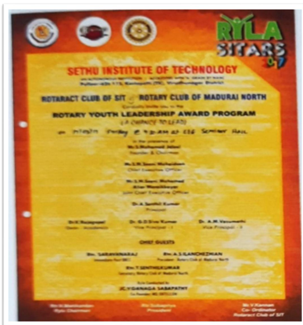
Broacher – RYLA – 2017

Name of the activity : RYLA-2017 Collaborative Agency : ROTARACT CLUB Year of the activity : 17.03.2017 No. of students participated : 32