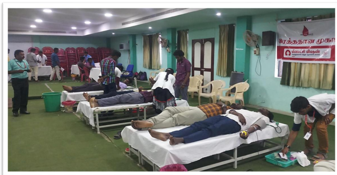
Blood Donation Camp - Phase 1 in collaboration with Meenakshi Mission Hospital and Research Centre – Madurai in the year 2017