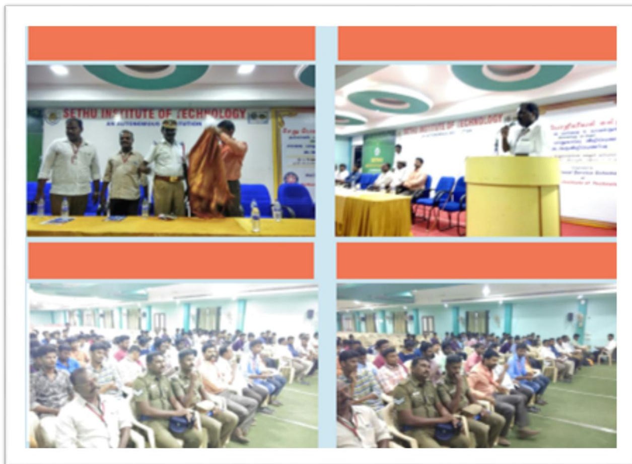
Awareness Program on Blue whale game & Dengue along with the Collaboration with Nam Kaaval Paarvai Magazine in the Year 2017