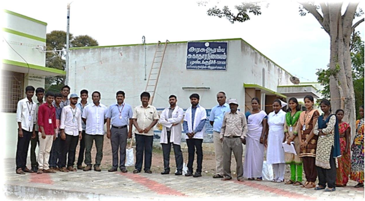
Members of Rotaract after Rural Development and Social Activity Program.