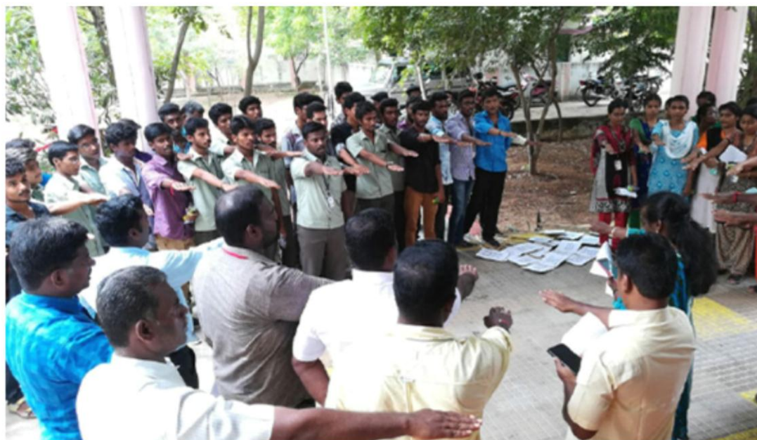
Rally on International day for Disaster Reduction along with the Collaboration with Dept. of Revenue, Thasildar Office – Kariapatti in the Year 2017