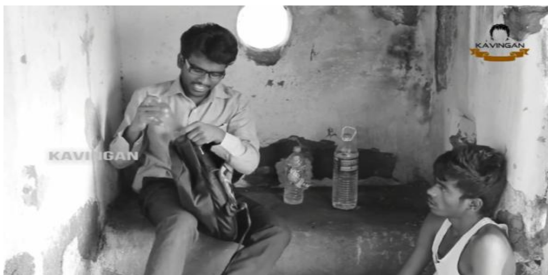
Short Film Event organized by YRC Madurai Division in the year 2017