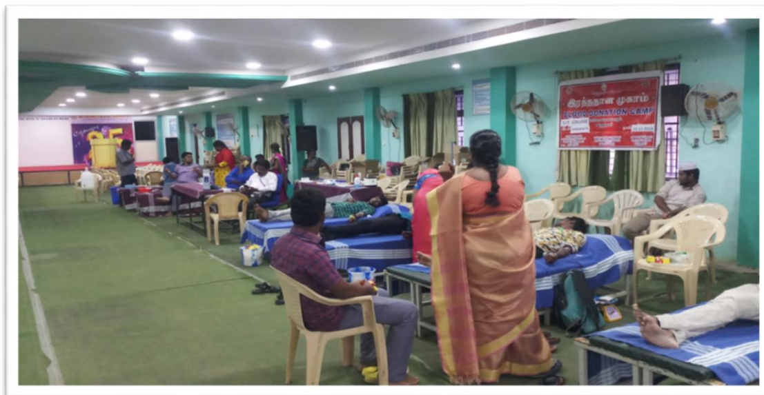
Blood Donation Camp - Phase 1 in collaboration with Meenakshi Mission Hospital and Research Centre – Madurai in the year 2017